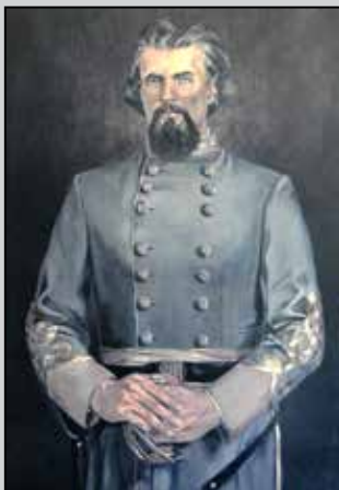
General Nathan Bedford Forrest 1821-1877

The Military Order of the Stars and Bars (MOS&B) was founded by fifteen gentlemen who, more than seven decades before, had served as commissioned officers in the armed forces of the Confederate States of America. It is the only active heritage organization created by Confederate Veterans. Today, the MOS&B is an educational, historical, genealogical, patriotic, and charitable tax-exempt organization whose members are the direct and collateral descendants of the Confederacy's commissioned officers and civil servants. The MOS&B is loyal to the United States, and many of its members have proudly served in the nation's armed forces and in state and federal civil service. The MOS&B is organized through local chapters, state societies, and a national organization. Meetings are held locally by the chapters, state societies hold annual meetings, and there is an annual national convention.