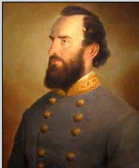
General Thomas Jonathan "Stonewall" Jackson 1824-1863