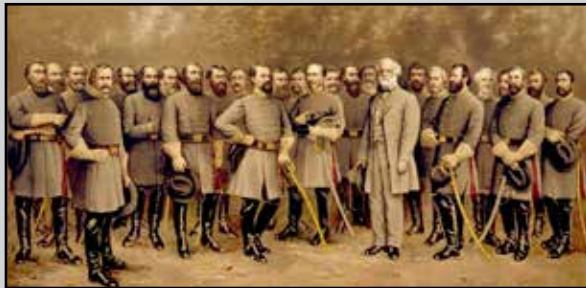
General Robert E. Lee and his Generals

We, the posterity of the Officer Corps and civil officials of the Confederacy, do pledge ourselves to commemorate and honor the service of leadership these men rendered in the cause of the fundamental American principles of self-determination and states' rights and to perpetuate the true history of their deeds for the edification of ourselves, our society, and for generations yet unborn.